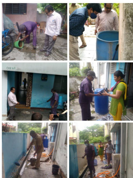
Mosquito Control Programme at CHD quarters – 10.09.22