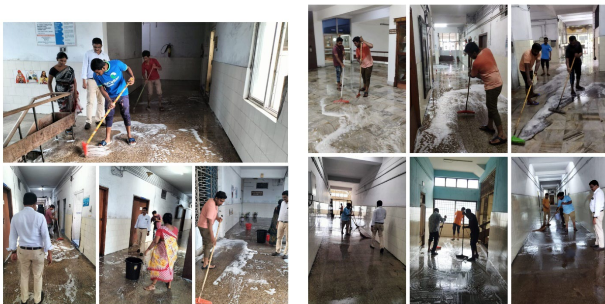
Special cleaning of Floors and Corridors at AOB, TM Building – 10.09.22