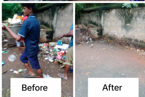
AOB & Main Road Area – 12.09.22