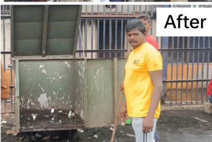
At W.Q berth On 10.09.22