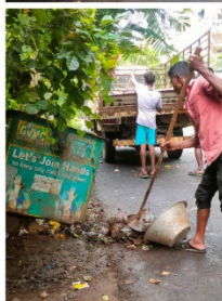
at SG Puram on 10.09.22